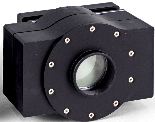
LINCcam40 with T-mount