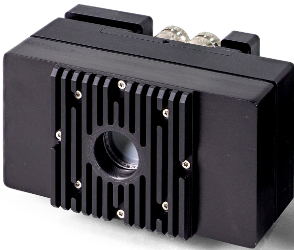
LINCcam25 with C-mount

LINCcam is a solution for scanning-free time correlated single photon counting implemented as a camera. This camera resolves x and y positions of individual photons as precise as a CCD with 1000 \times 1000 pixels does together with 50 ps accuracy timing. Being paired with a pulsed light source LINCcam turns any conventional fluorescence microscope into a powerful lifetime measuring instrument. LINCcam with attached off-the-shelf optics is a solution for macroscopic applications like LIDAR. In other words, LINCcam is just a camera. As easy as an ordinal megapixel CCD camera but extended with the timing dimension.