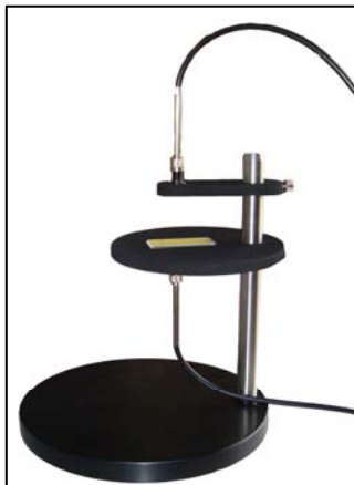
TFX4 variable transmission fixture