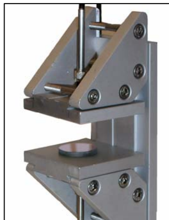
TFX3 variable transmission fixture