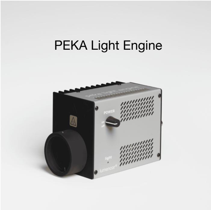
PEKA Light Engine